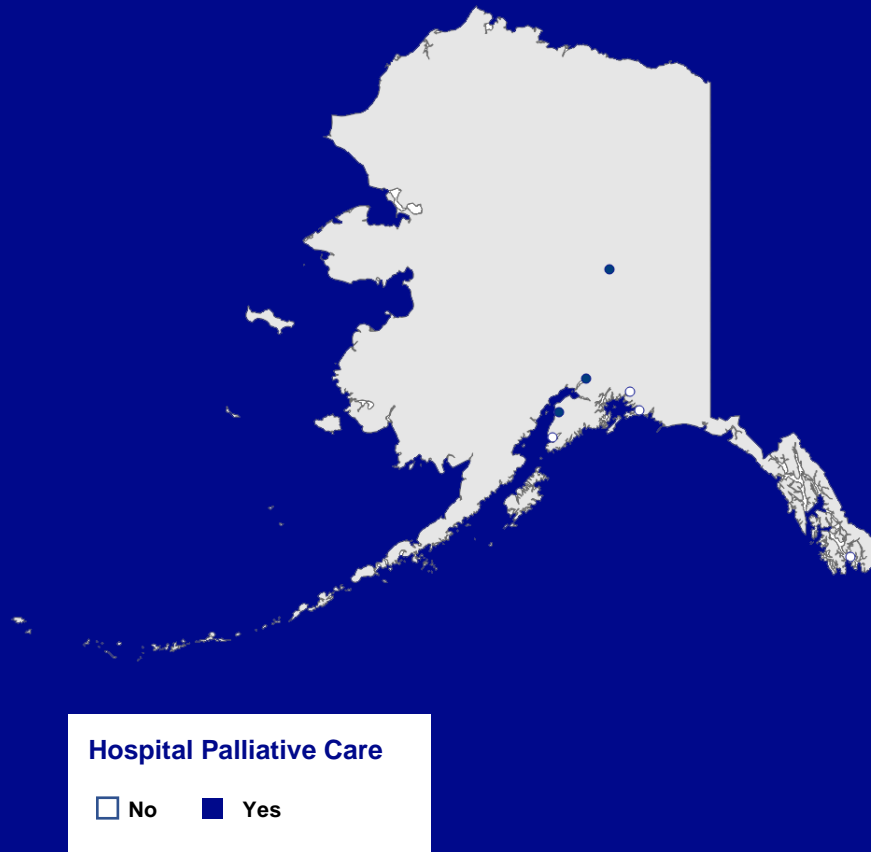
Figure 2. Availability of Hospital Palliative Care in Alaska

The map below (figure 2) shows all Alaska hospitals that report inpatient palliative care availability and includes hospitals of all sizes. d Solid dots represent hospitals that report having a palliative care program or unit, and empty dots represent hospitals that do not currently report inpatient palliative care.