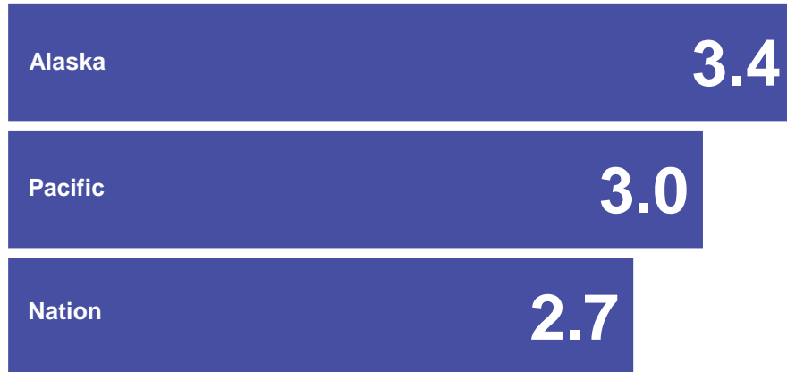
Figure 4. Prescribers Certified in Specialty Palliative Care per 100,000 Population

There are at least 25 certified prescribing palliative care providers in your state, resulting in at least 3.4 per 100,000 residents in your state (this includes MDs and APRNs only; data for DOs and PAs is currently unavailable at the state level). 9 This capacity is likely insufficient to meet the needs of your state, but training non-palliative care prescribers in the basics of caring for people with serious illness can be an important strategy to complement your state's specialty palliative care workforce.