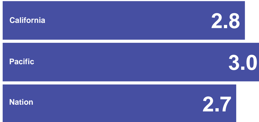
Figure 4. Prescribers Certified in Specialty Palliative Care per 100,000 Population

There are at least 1093 certified prescribing palliative care providers in your state, resulting in at least 2.8 per 100,000 residents in your state (this includes MDs and APRNs only; data for DOs and PAs is currently unavailable at the state level). g This capacity is likely insufficient to meet the needs of your state, but training non-palliative care prescribers in the basics of caring for people with serious illness can be an important strategy to complement your state's specialty palliative care workforce.