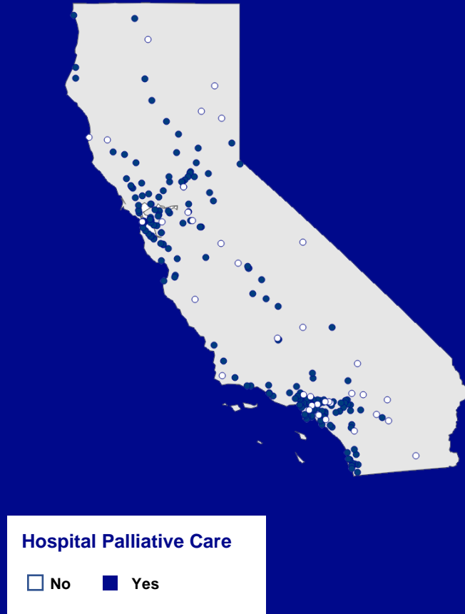
Figure 2. Availability of Hospital Palliative Care in California

The map below (figure 2) shows all California hospitals that report inpatient palliative care availability and includes hospitals of all sizes. d Solid dots represent hospitals that report having a palliative care program or unit, and empty dots represent hospitals that do not currently report inpatient palliative care.