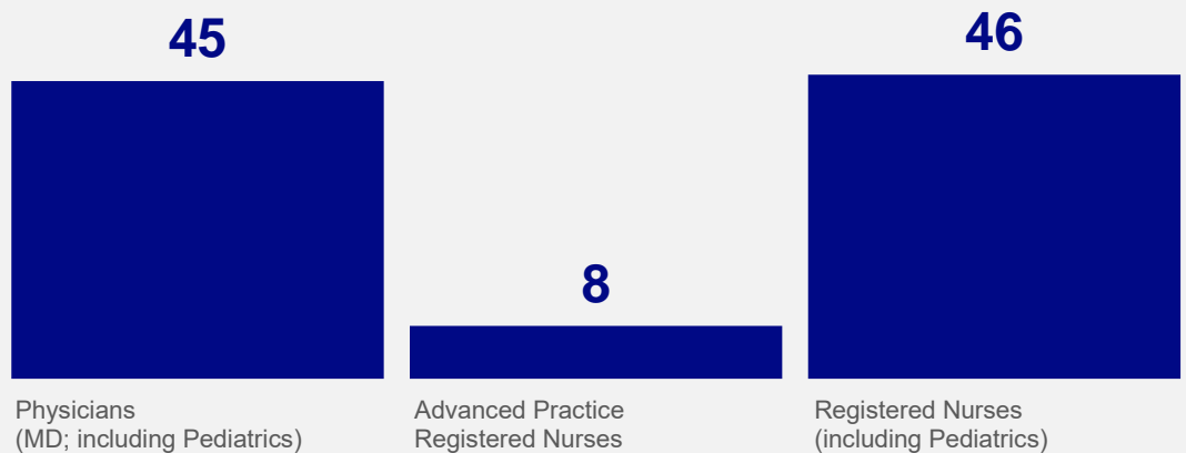
Figure 3. Count of Palliative Care Certified Physicians, Advanced Practice Registered Nurses, and registered Nurses in Hawai'i

The graph below (figure 3) shows the numbers of MDs, APRNs, and RNs that have received specialty certification in palliative care or pediatric palliative care in Hawai'i. f (Palliative care-certified Doctors of Osteopathy (DOs), PAs, social workers, and chaplains may be providing palliative care in your state, but these numbers were either unavailable or too low to be included at the state level.) Additional members of the interprofessional palliative care team may include pharmacists, home health aides, therapists, and other health professionals, although specialty palliative care certification does not currently exist in these fields.