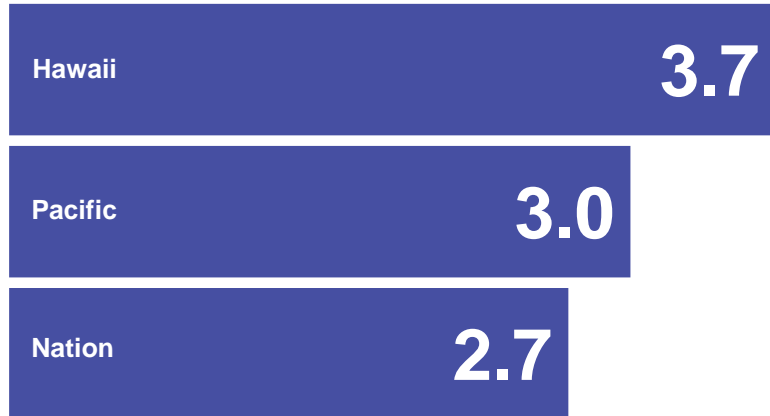
Figure 4. Prescribers Certified in Specialty Palliative Care per 100,000 Population

There are at least 53 certified prescribing palliative care providers in your state, resulting in at least 3.7 per 100,000 residents in your state (this includes MDs and APRNs only; data for DOs and PAs is currently unavailable at the state level). 9 This capacity is likely insufficient to meet the needs of your state, but training non-palliative care prescribers in the basics of caring for people with serious illness can be an important strategy to complement your state's specialty palliative care workforce.