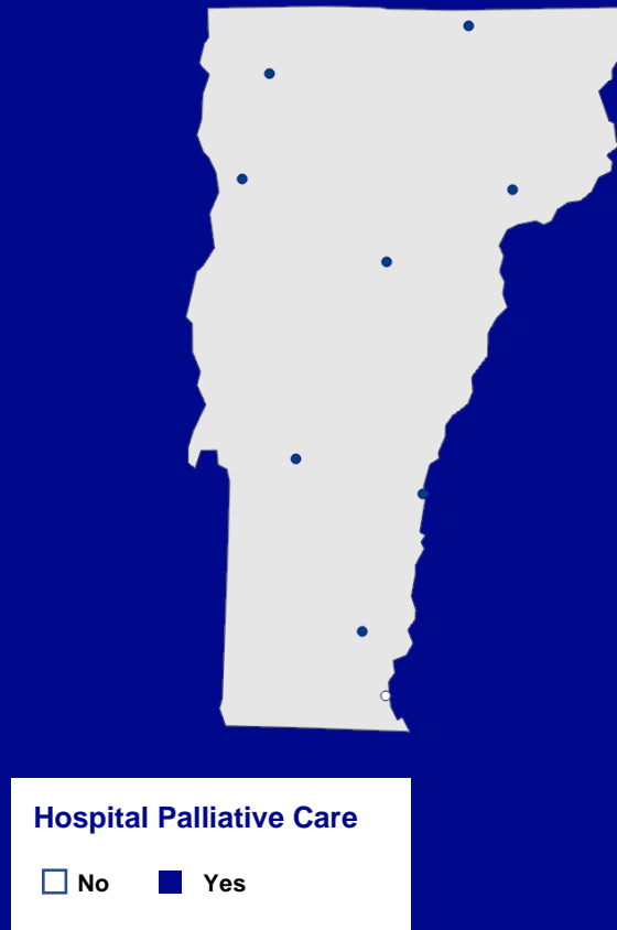
Figure 2. Availability of Hospital Palliative Care in Vermont

The map below (figure 2) shows all Vermont hospitals that report inpatient palliative care availability and includes hospitals of all sizes. d Solid dots represent hospitals that report having a palliative care program or unit, and empty dots represent hospitals that do not currently report inpatient palliative care.