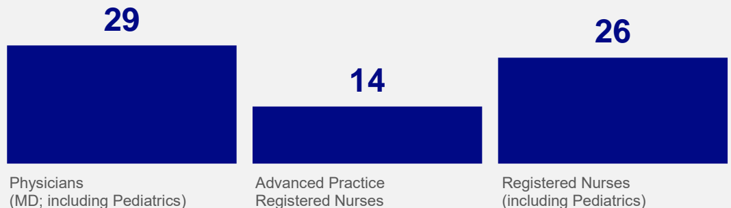
Figure 3. Count of Palliative Care Certified Physicians, Advanced Practice Registered Nurses, and registered Nurses in Vermont

The graph below (figure 3) shows the numbers of MDs, APRNs, and RNs that have received specialty certification in palliative care or pediatric palliative care in Vermont. f (Palliative care-certified Doctors of Osteopathy (DOs), PAs, social workers, and chaplains may be providing palliative care in your state, but these numbers were either unavailable or too low to be included at the state level.) Additional members of the interprofessional palliative care team may include pharmacists, home health aides, therapists, and other health professionals, although specialty palliative care certification does not currently exist in these fields.