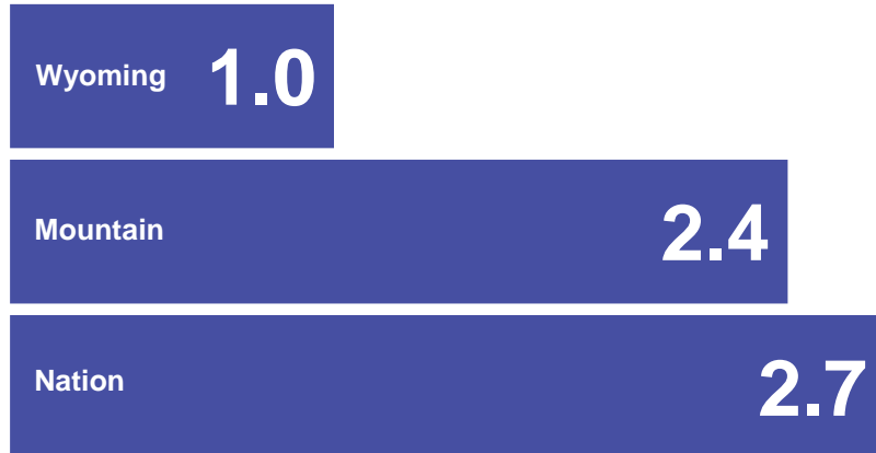
Figure 4. Prescribers Certified in Specialty Palliative Care per 100,000 Population

There are at least 6 certified prescribing palliative care providers in your state, resulting in at least 1.0 per 100,000 residents in your state (this includes MDs and APRNs only; data for DOs and PAs is currently unavailable at the state level). 9 This capacity is likely insufficient to meet the needs of your state, but training non-palliative care prescribers in the basics of caring for people with serious illness can be an important strategy to complement your state's specialty palliative care workforce.