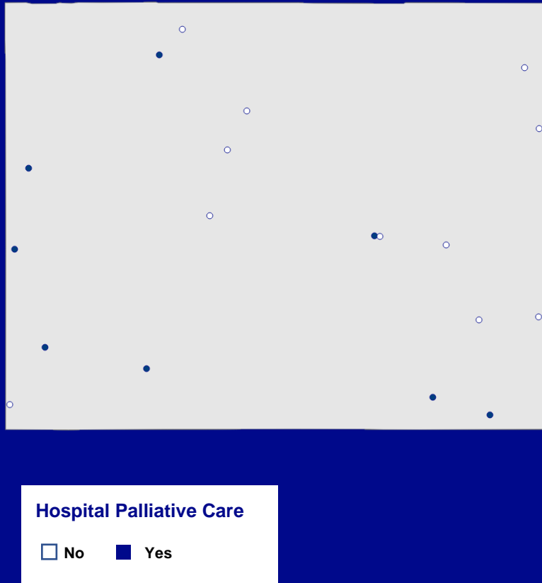
Figure 2. Availability of Hospital Palliative Care in Wyoming

The map below (figure 2) shows all Wyoming hospitals that report inpatient palliative care availability and includes hospitals of all sizes. d Solid dots represent hospitals that report having a palliative care program or unit, and empty dots represent hospitals that do not currently report inpatient palliative care.