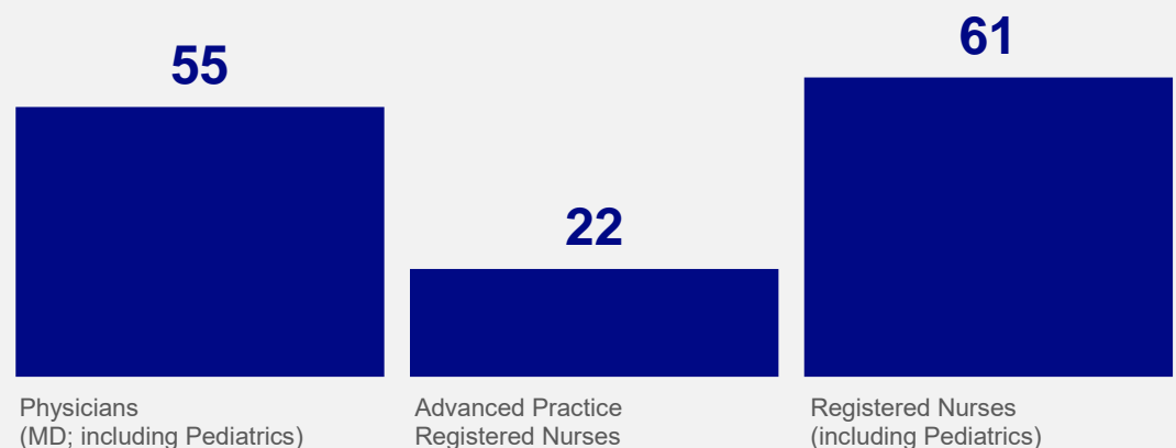
Figure 3. Count of Palliative Care Certified Physicians, Advanced Practice Registered Nurses, and registered Nurses in Alabama

The graph below (figure 3) shows the numbers of MDs, APRNs, and RNs that have received specialty certification in palliative care or pediatric palliative care in Alabama. f (Palliative care-certified Doctors of Osteopathy (DOs), PAs, social workers, and chaplains may be providing palliative care in your state, but these numbers were either unavailable or too low to be included at the state level.) Additional members of the interprofessional palliative care team may include pharmacists, home health aides, therapists, and other health professionals, although specialty palliative care certification does not currently exist in these fields.