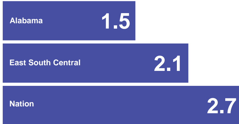
Figure 4. Prescribers Certified in Specialty Palliative Care per 100,000 Population

There are at least 77 certified prescribing palliative care providers in your state, resulting in at least 1.5 per 100,000 residents in your state (this includes MDs and APRNs only; data for DOs and PAs is currently unavailable at the state level). g This capacity is likely insufficient to meet the needs of your state, but training non-palliative care prescribers in the basics of caring for people with serious illness can be an important strategy to complement your state's specialty palliative care workforce.