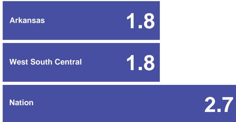
Figure 4. Prescribers Certified in Specialty Palliative Care per 100,000 Population

There are at least 55 certified prescribing palliative care providers in your state, resulting in at least 1.8 per 100,000 residents in your state (this includes MDs and APRNs only; data for DOs and PAs is currently unavailable at the state level). g This capacity is likely insufficient to meet the needs of your state, but training non-palliative care prescribers in the basics of caring for people with serious illness can be an important strategy to complement your state's specialty palliative care workforce.