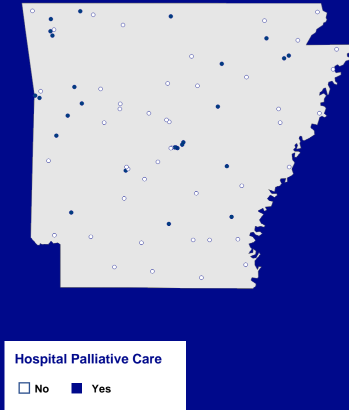
Figure 2. Availability of Hospital Palliative Care in Arkansas

The map below (figure 2) shows all Arkansas hospitals that report inpatient palliative care availability and includes hospitals of all sizes. d Solid dots represent hospitals that report having a palliative care program or unit, and empty dots represent hospitals that do not currently report inpatient palliative care.