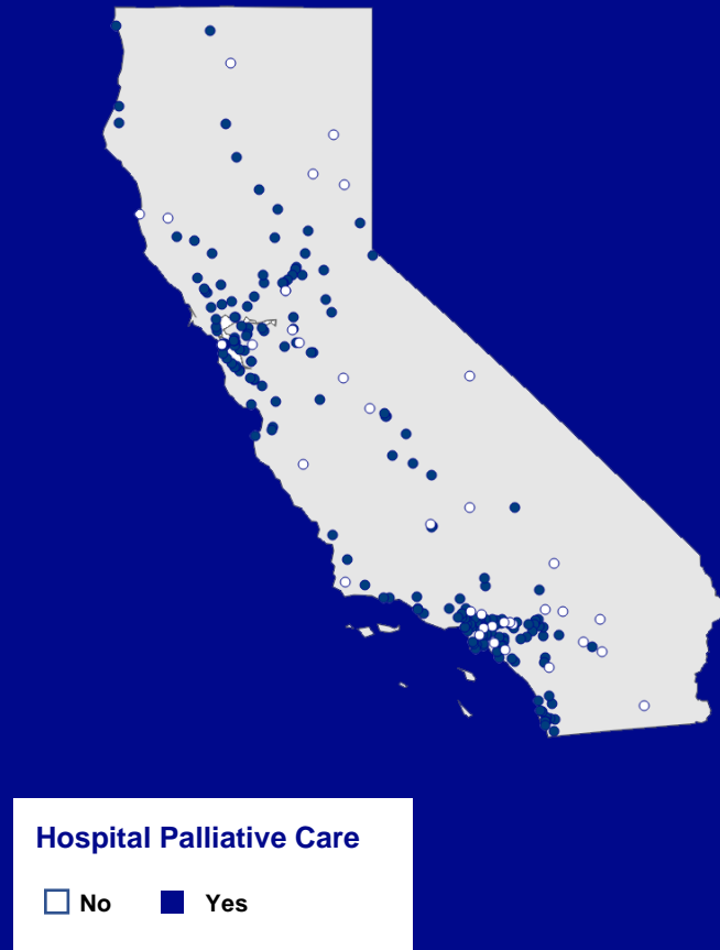
Figure 2. Availability of Hospital Palliative Care in California

The map below (figure 2) shows all California hospitals that report inpatient palliative care availability and includes hospitals of all sizes. d Solid dots represent hospitals that report having a palliative care program or unit, and empty dots represent hospitals that do not currently report inpatient palliative care.