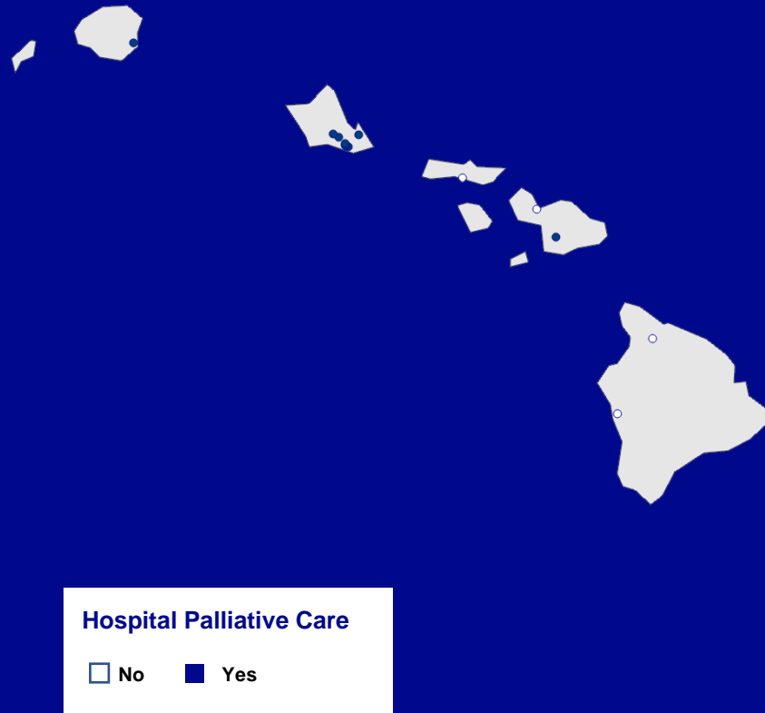
Figure 2. Availability of Hospital Palliative Care in Hawai'i

The map below (figure 2) shows all Hawai'i hospitals that report inpatient palliative care availability and includes hospitals of all sizes. d Solid dots represent hospitals that report having a palliative care program or unit, and empty dots represent hospitals that do not currently report inpatient palliative care.