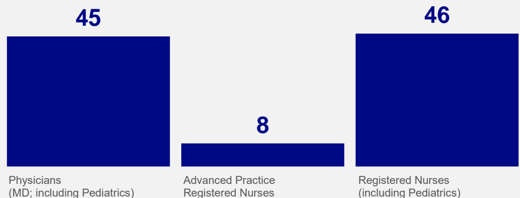
Figure 3. Count of Palliative Care Certified Physicians, Advanced Practice Registered Nurses, and registered Nurses in Hawai'i

The graph below (figure 3) shows the numbers of MDs, APRNs, and RNs that have received specialty certification in palliative care or pediatric palliative care in Hawai'i. f (Palliative care-certified Doctors of Osteopathy (DOs), PAs, social workers, and chaplains may be providing palliative care in your state, but these numbers were either unavailable or too low to be included at the state level.) Additional members of the interprofessional palliative care team may include pharmacists, home health aides, therapists, and other health professionals, although specialty palliative care certification does not currently exist in these fields.