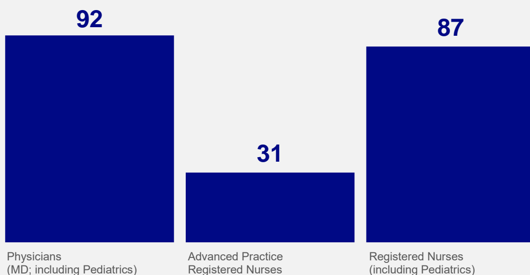
Figure 3. Count of Palliative Care Certified Physicians, Advanced Practice Registered Nurses, and registered Nurses in Missouri

The graph below (figure 3) shows the numbers of MDs, APRNs, and RNs that have received specialty certification in palliative care or pediatric palliative care in Missouri. f (Palliative care-certified Doctors of Osteopathy (DOs), PAs, social workers, and chaplains may be providing palliative care in your state, but these numbers were either unavailable or too low to be included at the state level.) Additional members of the interprofessional palliative care team may include pharmacists, home health aides, therapists, and other health professionals, although specialty palliative care certification does not currently exist in these fields.