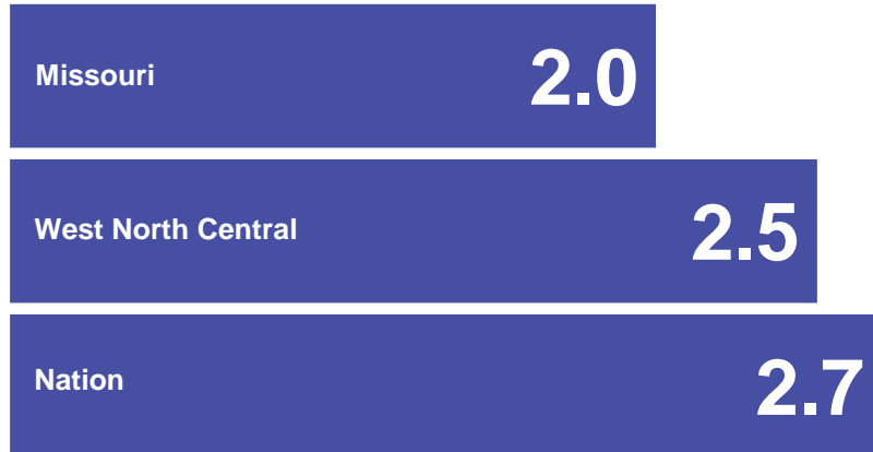
Figure 4. Prescribers Certified in Specialty Palliative Care per 100,000 Population

There are at least 123 certified prescribing palliative care providers in your state, resulting in at least 2.0 per 100,000 residents in your state (this includes MDs and APRNs only; data for DOs and PAs is currently unavailable at the state level). g This capacity is likely insufficient to meet the needs of your state, but training non-palliative care prescribers in the basics of caring for people with serious illness can be an important strategy to complement your state's specialty palliative care workforce.