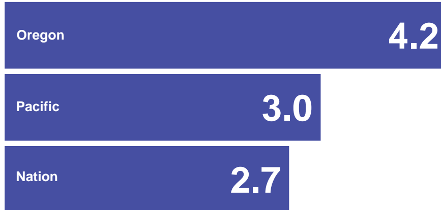
Figure 4. Prescribers Certified in Specialty Palliative Care per 100,000 Population

There are at least 176 certified prescribing palliative care providers in your state, resulting in at least 4.2 per 100,000 residents in your state (this includes MDs and APRNs only; data for DOs and PAs is currently unavailable at the state level). g This capacity is likely insufficient to meet the needs of your state, but training non-palliative care prescribers in the basics of caring for people with serious illness can be an important strategy to complement your state's specialty palliative care workforce.