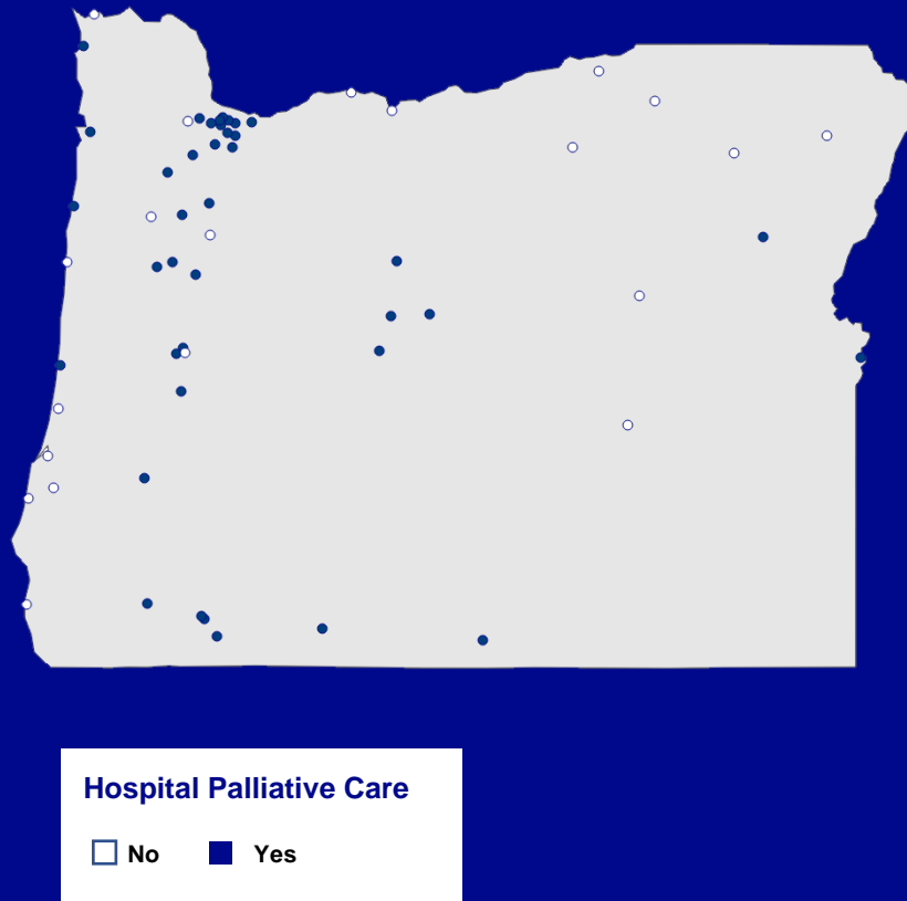
Figure 2. Availability of Hospital Palliative Care in Oregon

The map below (figure 2) shows all Oregon hospitals that report inpatient palliative care availability and includes hospitals of all sizes. d Solid dots represent hospitals that report having a palliative care program or unit, and empty dots represent hospitals that do not currently report inpatient palliative care.